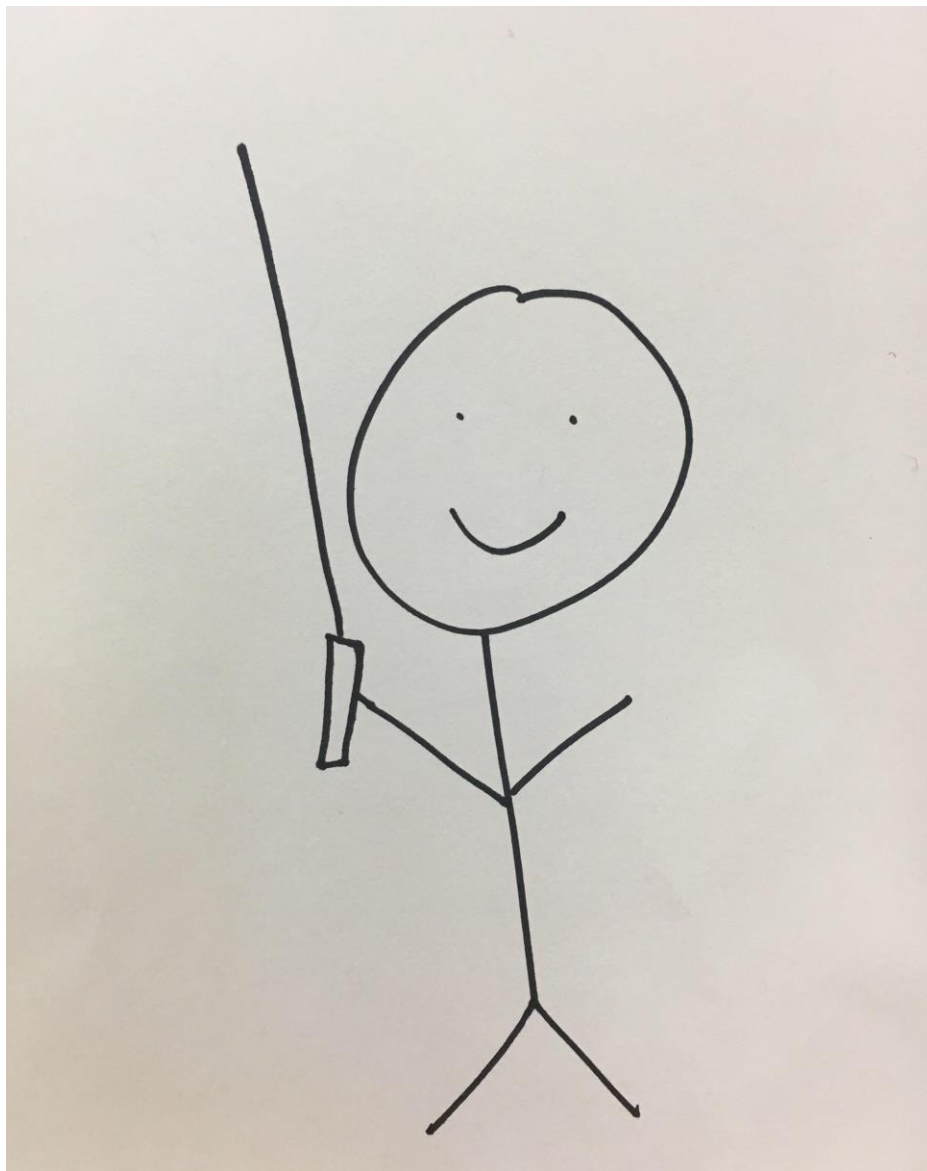
Bob is going somewhere.