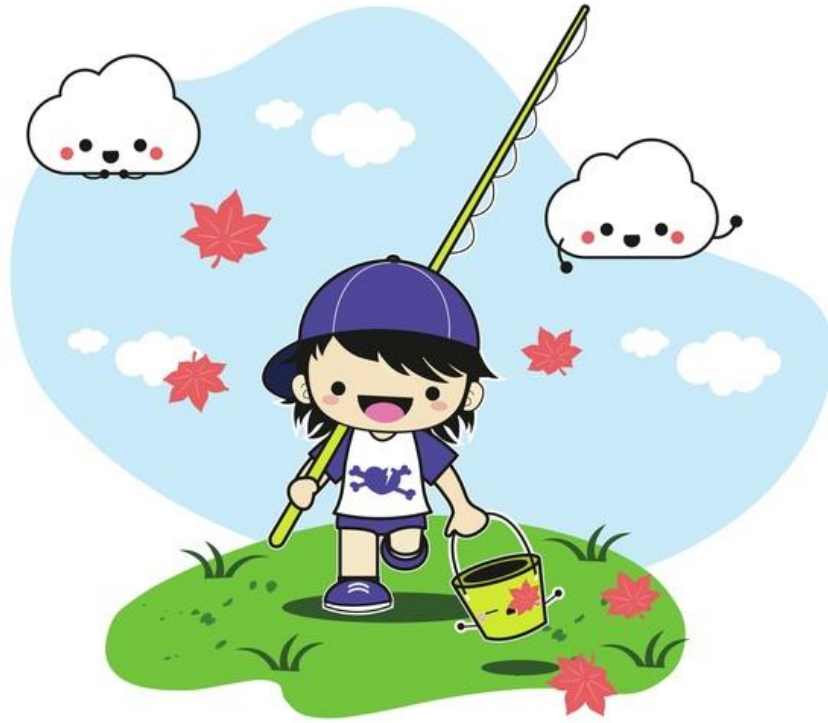
Bob is going on a vacation.